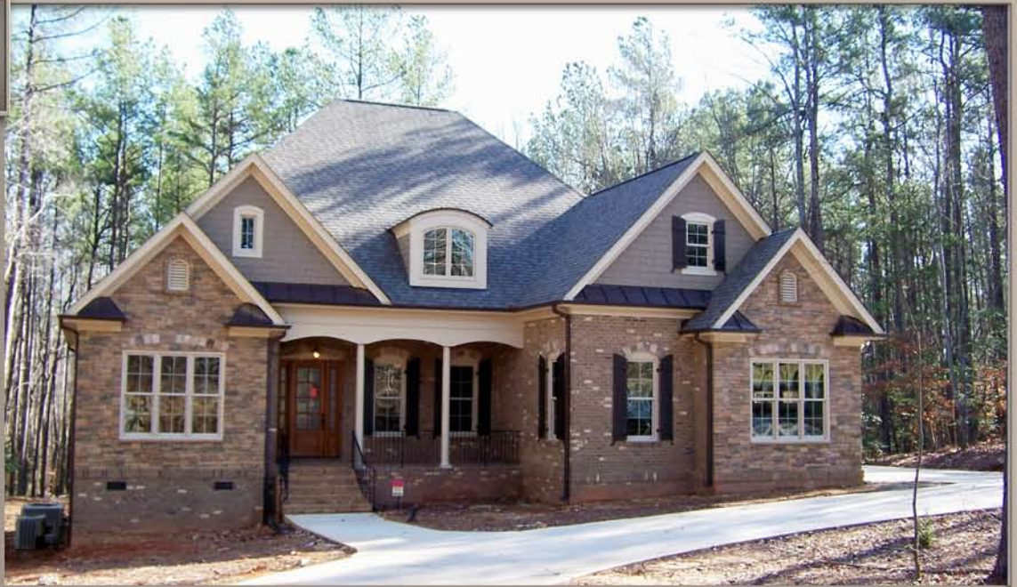
Homesite 39 7445 Sexton's Creek Drive