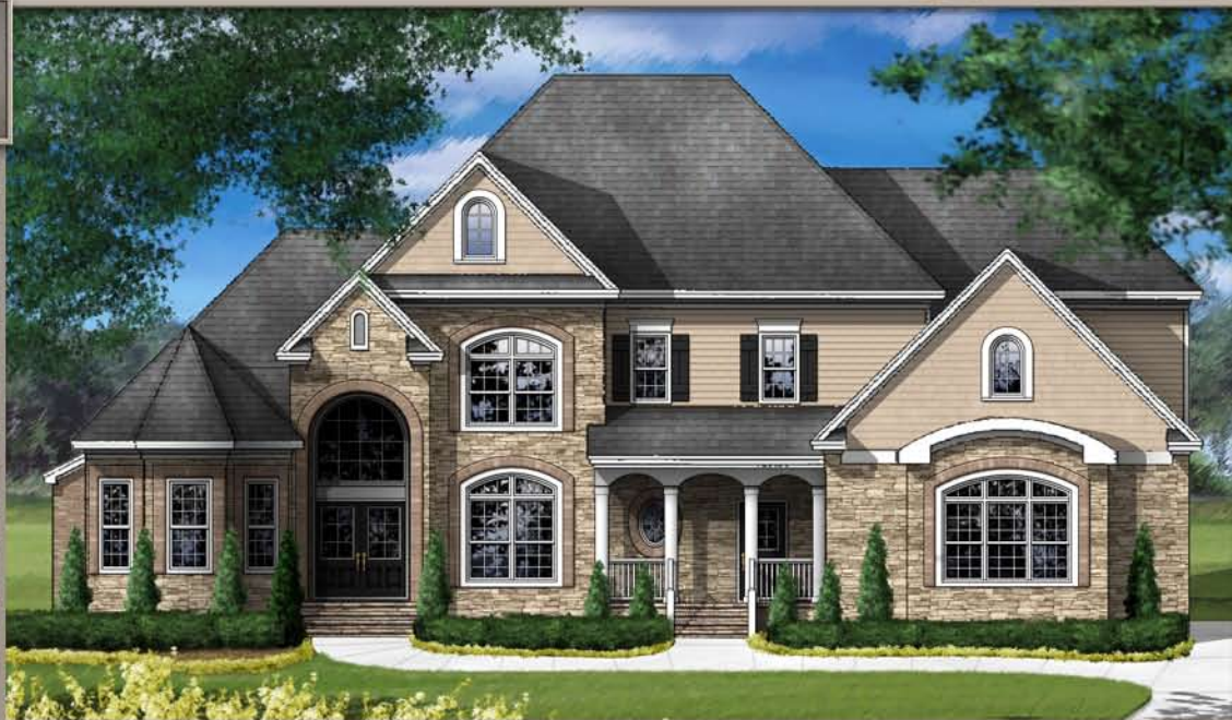
Homesite 6 12308 The Gates Drive